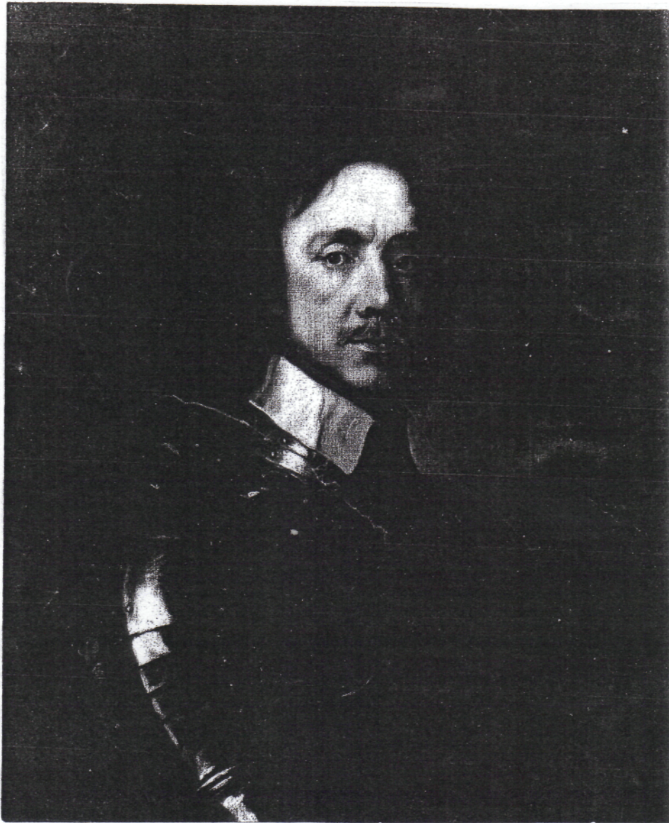
ROBERT WALKER (d. 1658) Oliver Cromwell , c.1649