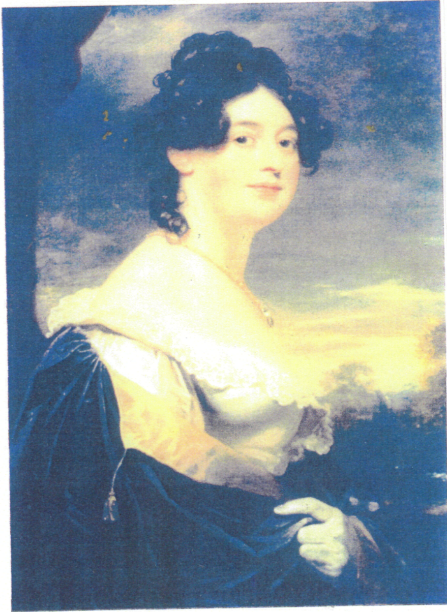
WILLIAM BEECHEY (1753-1839) Mrs Coutts (later Duchess of St. Albans), c. 1815