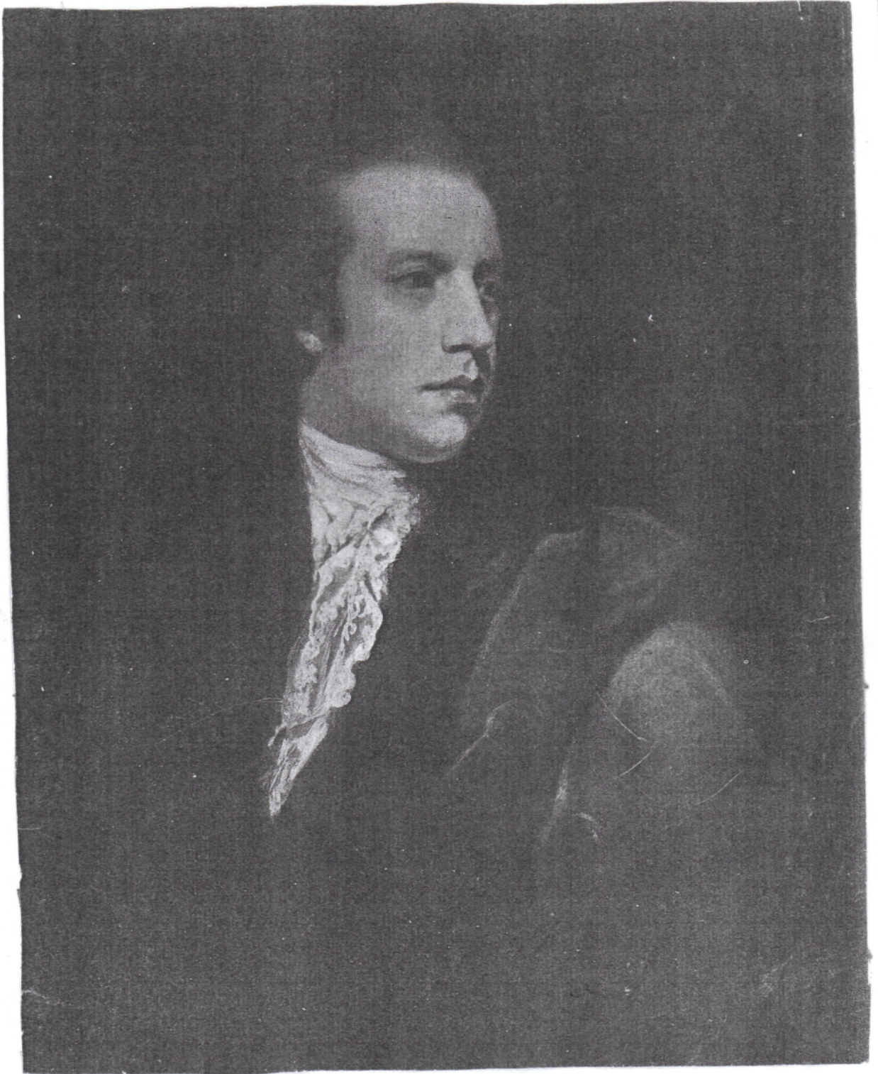
JOSHUA REYNOLDS, 1793-1792 James Coutts c. 1771-1773