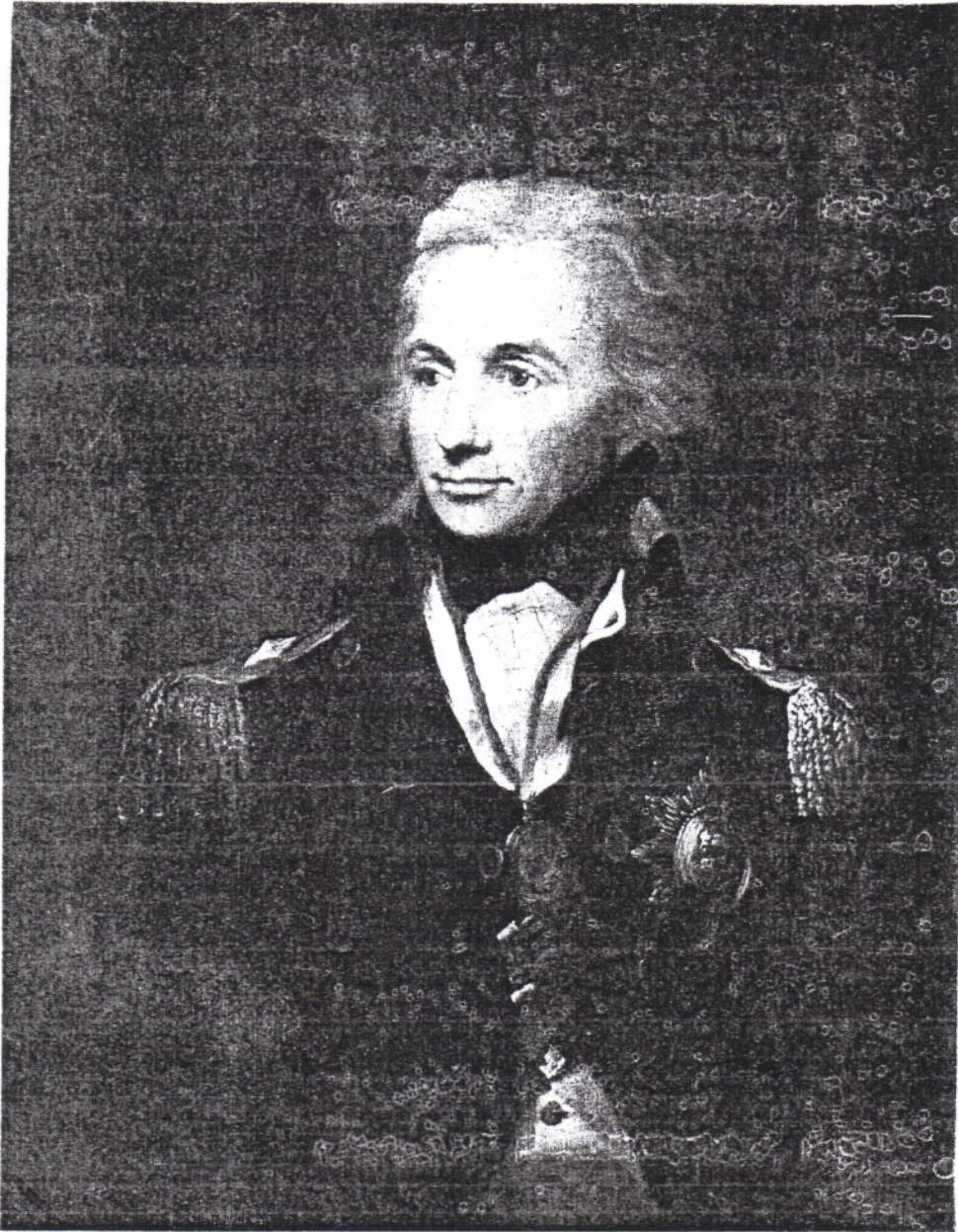
LEMEUL F. ABBOTT (1760-1805) Admiral Nelson, 1797.