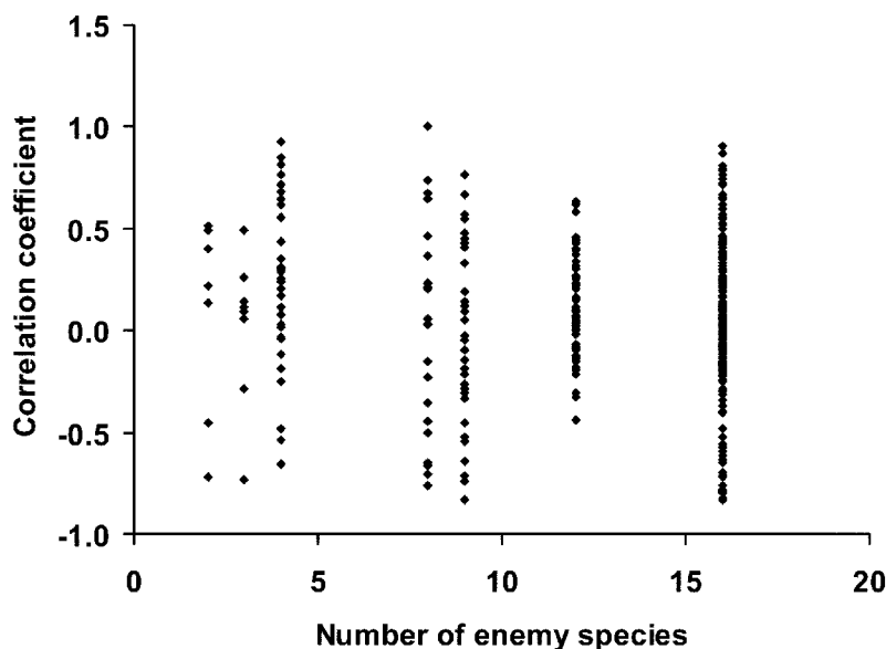
Figure 1: Individual genetic correlations between plant resistances to pairs of natural enemies in relation to the number of natural enemy species examined per study.

confidence interval did not include 0. At the end of the analysis, the mean z values and their 95% confidence intervals were back-transformed to the Pearson correlation coefficients for ease of interpretation.