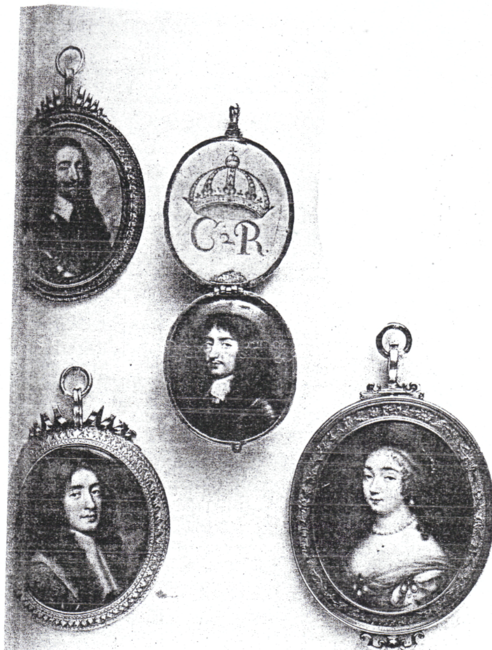
JEAN PETITOT (1607-1691) Charles I, Charles II, James I and Henrietta, Duchess of Orleans.

Enamel Miniatures. Measurements Unknown.