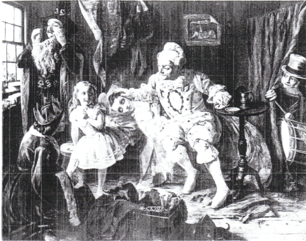
REBECCA SOLOMON (1832-1866) Behind the Curtain, 1858