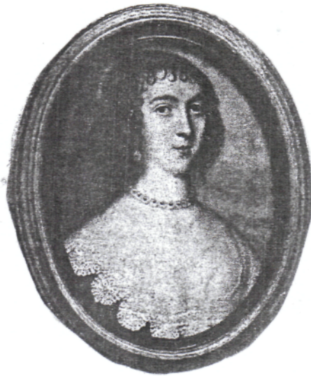
PETER OLIVER (c.1596-1647) Lady Venetia Digby aged Nineteen, c. 1619

[Watercolour on vellum?] Measurements Unknown