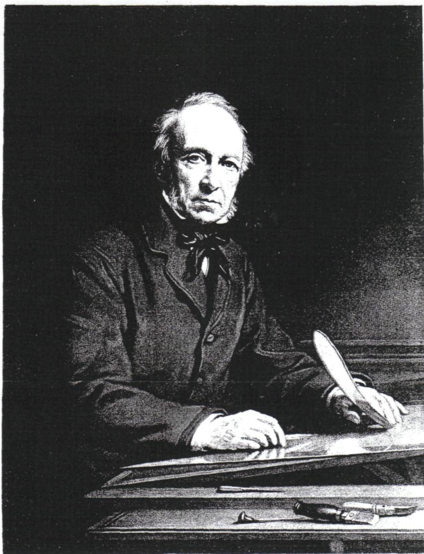
EDWIN LONGSDEN LONG (1829-1891) Samuel Cousins, 1882