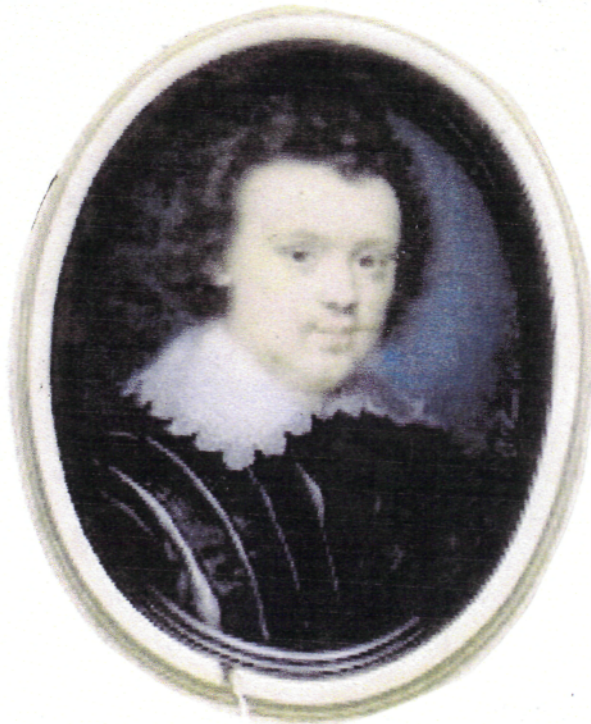
PETER OLIVER (c. 1696-1647) Sir Kenelm Digby, 1627.

Watercolour on vellum 2 3 / 4 x 2 1 / 8 (7 x 5 cm)