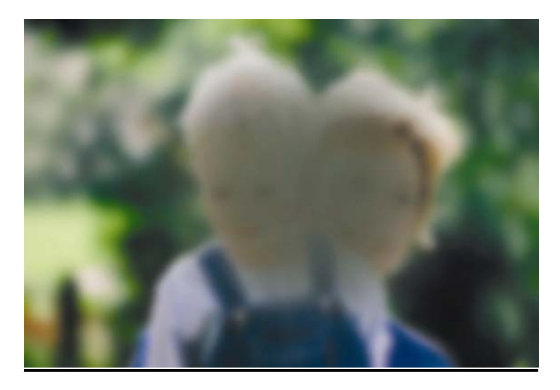
Figure 3 Scene as observed with severe MD. The scene is very blurred and no detail is detectable in the centre of the picture

Figure 2 Scene as observed with mild MD. Vision is blurred and there is some distortion