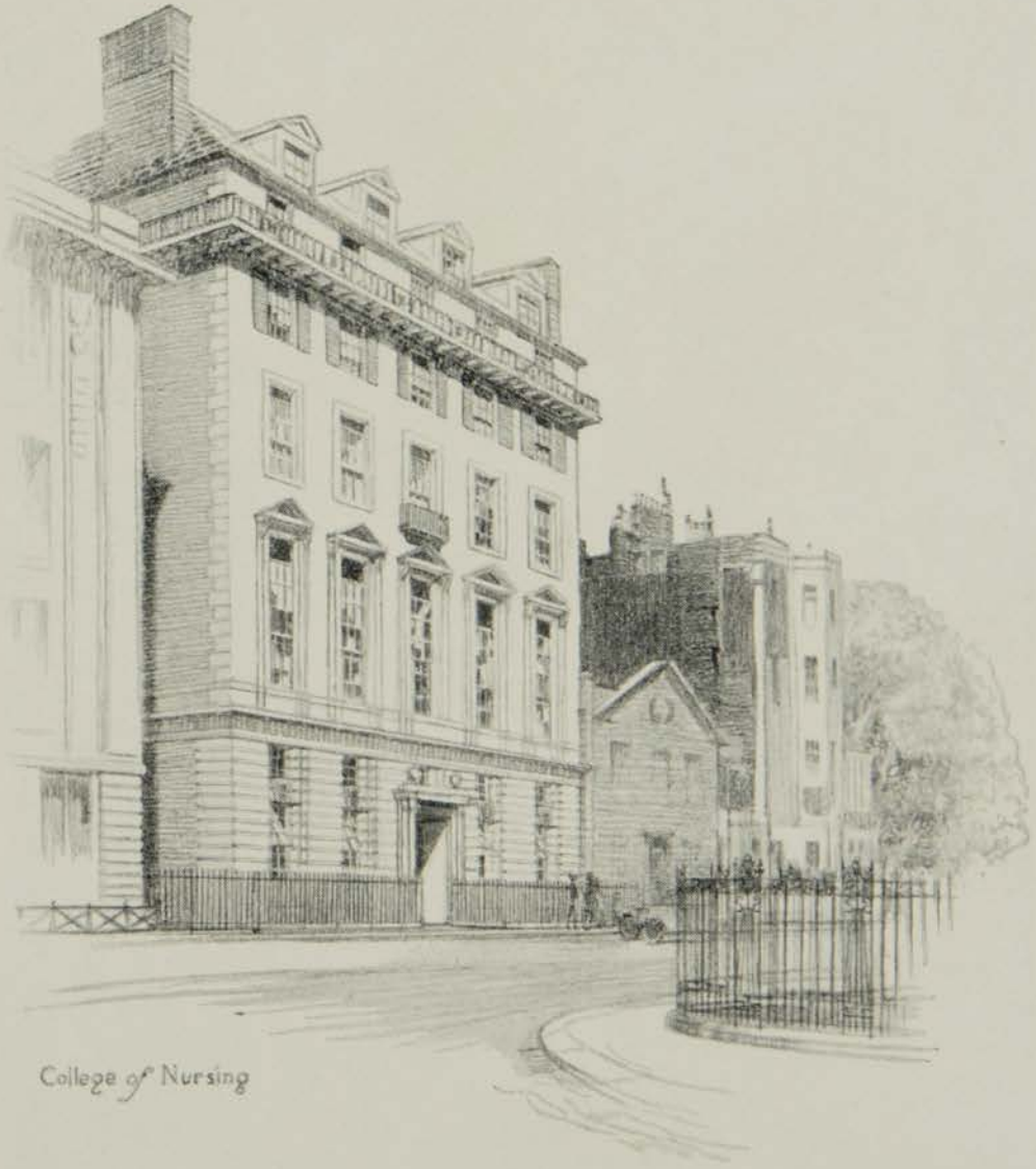
College of Nursing